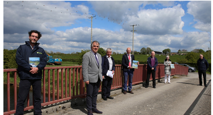
Investment of €180,000 was announced for waterside infrastructure at the Red Bridge, Ballymahon