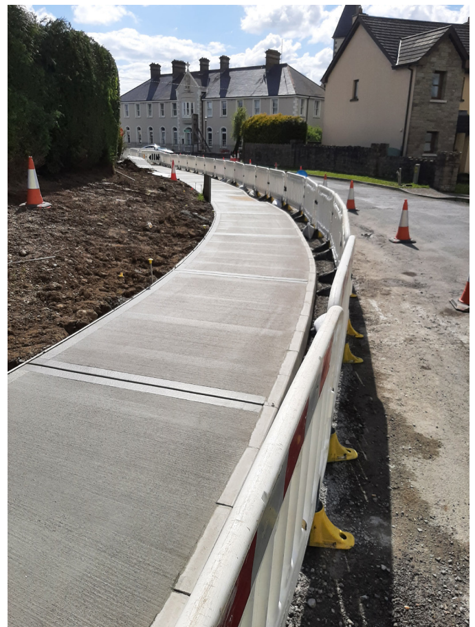
Pavement works in Newtownforbes

The Department of Transport has advised that additional funding of €15m is available to support Local Authorities in implementing traffic management and roads and streets public realm improvements in urban areas. Longford County Council were notified of an allocation of €150,000 for Edgeworthstown by the National Transport Authority.