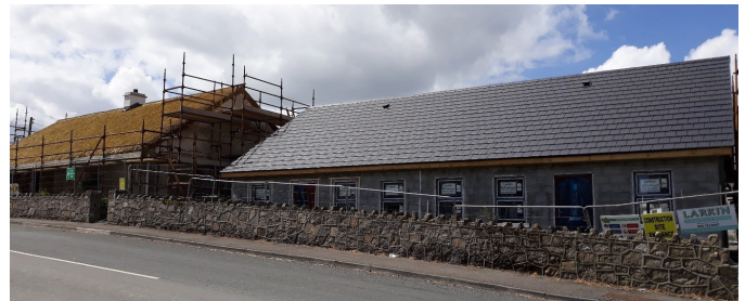
Unit at Rose Cottage, Ballinalee

Under the National Energy Efficiency Programme, survey works were completed on 19 houses at Sli na Mona, Ballymahon. This newly-revised 2021 Energy Efficiency Retrofit Programme is the first year of a ten-year programme which involves significant upscaling on works completed by local authorities to date. The preliminary allocation for Longford County Council for 2021 is €523,091 with a requirement to retrofit a minimum of 19 properties to a B2/Cost Optimal standard. All works under the 2021 programme must be completed by end-October 2021.