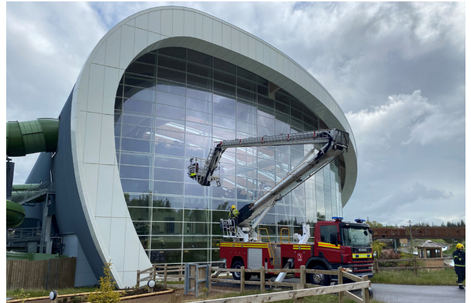
Fire Services training took place at Center Parcs Longford Forest

Three applications have been received with one candidate going forward to interview.