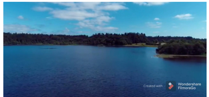
Grow Remote Longford Creative Film Project