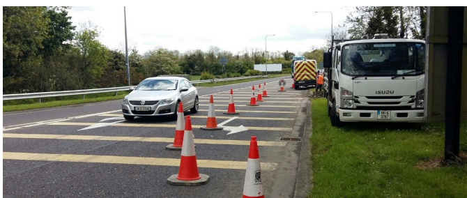
The 'Find & Fix' Team at work

The 'Find & Fix' Programme is a national capital project aimed at reducing water leakage in the network. Drinking water is a valuable resource and its production requires high energy use, therefore water conservation plays a major role in the way that Irish Water and the local authorities mitigate and adapt to climate change. Longford County Council Find & Fix team are currently operating in the Whitehill and Ballymakeegan areas and achieved significant savings of approximately 62,800 litres of drinking water per day in May through its Find & Fix activities.