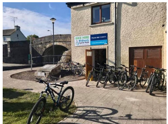
Longford Tourism promoted the recently opened Midlands Cycle Hub in Clondra (Clondara) on social media

Work continued on Longford.ie and with Waterways Ireland and other counties on the trailhead boards and brochure for the Royal Canal Greenway.