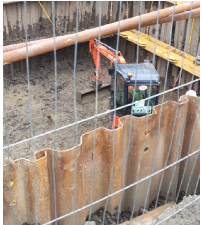
Deep excavation works for a clear water tank at Lough Forbes

Irish Water in consultation with Longford County Council have undertaken the ECI Programme in Longford. This national programme aims at carry out improvement works at water treatment plants throughout Ireland to ensure continued delivery of safe drinking water. The programme has now commenced at Lough Forbes where deep excavation works for an enlarged clear water tank are in progress. This is a very significant project in terms of scale and cost, which when completed will in eighteen months deliver increased water supply capacity as well as enhanced water quality to a large part of the county.